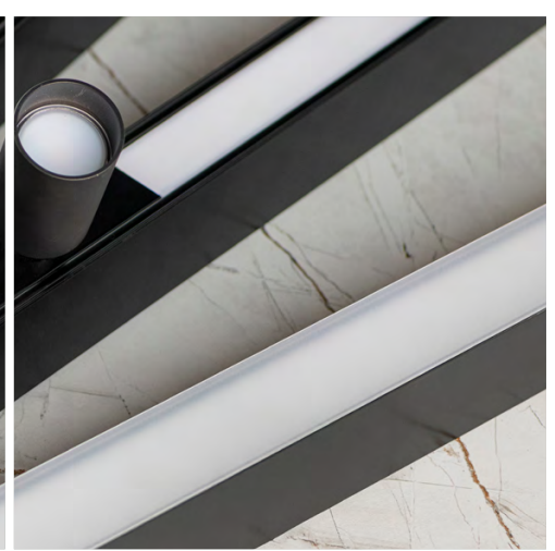
Enclosure material: steel, plastic